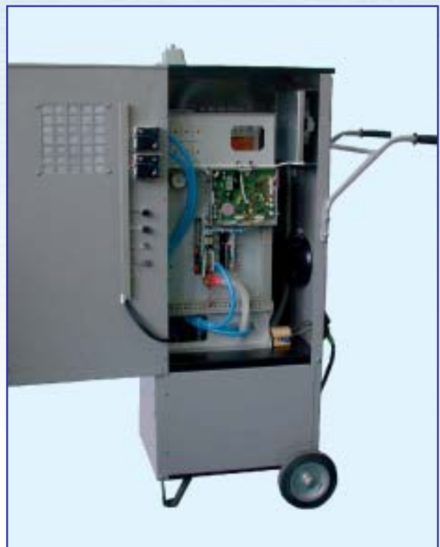
MOBILE HEATING UNIT WITH GI55 GENERATOR