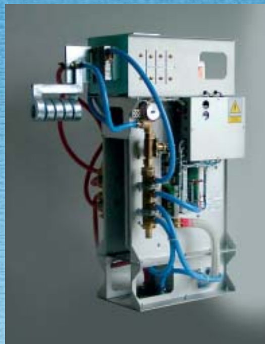
GENERATOR GI 55

1) THE OTHER TYPE OF ENCLOSURE COULD BE DELIVERED ON REQUEST