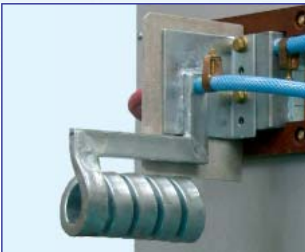
VIEW OF CONNECTION OF THE WORKING COIL

All protection functions are provided as a standard in control circuit therefore over currents, over voltages, underflow of cooling water etc. are detected and monitored continuously.